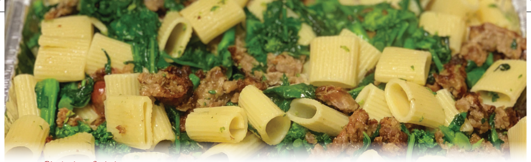
Rigatoni con Sasiccia