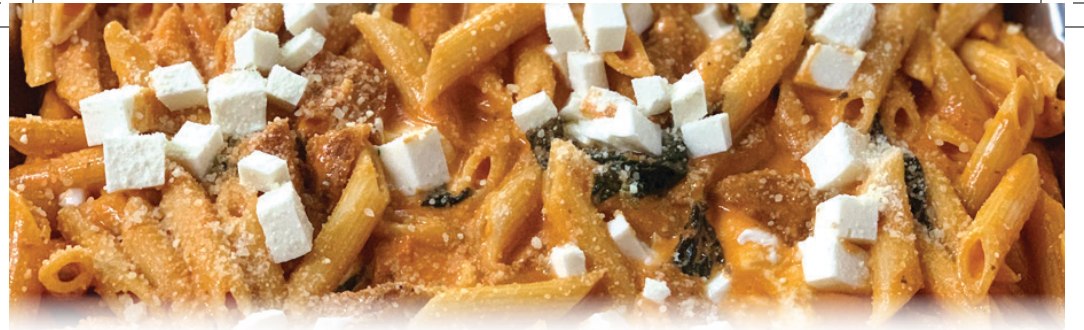
Bottega alla Vodka