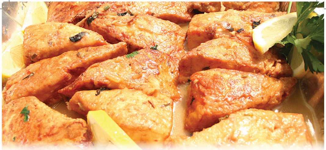
Salmone al Vino Bianco